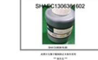
SHAC130636 (602) 摘要: ... SGS... SGS... SGS...

測試報告 No. SHAC130636 (01) 0150500001 016,744