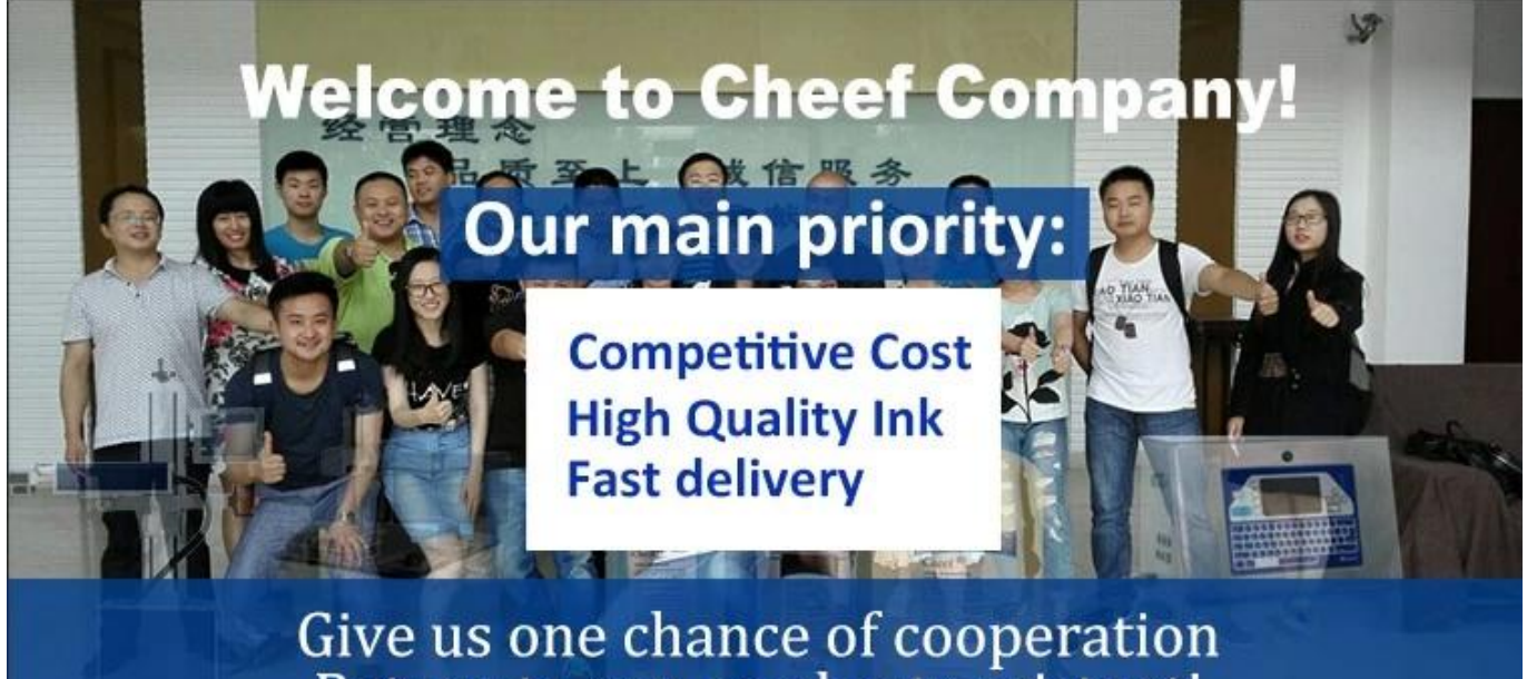
small character inkjet printer for videojet

Give us one chance of cooperation Return to you one best assistant!